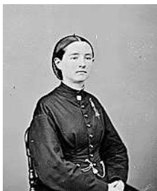
Dr. Mary Walker